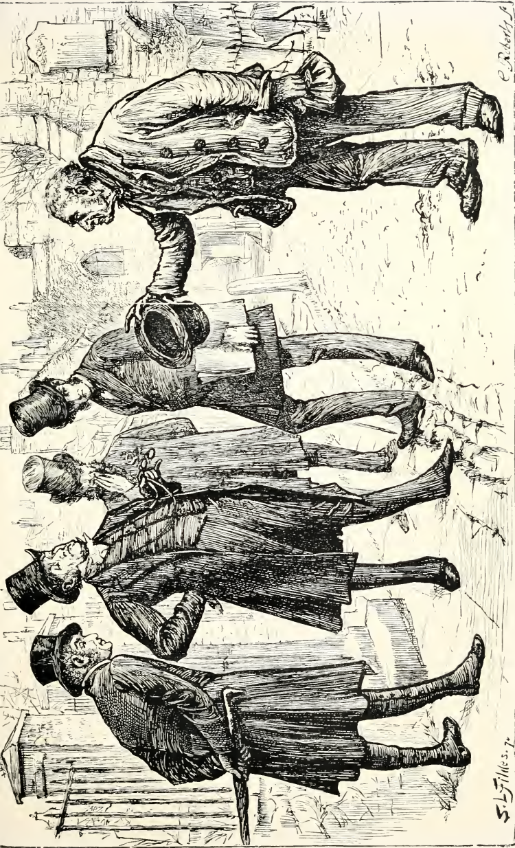
Durdles Cautions Mr. Sapsea against Boasting.